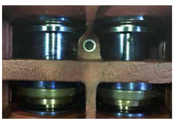
Components (main shafts) for palm oil extract